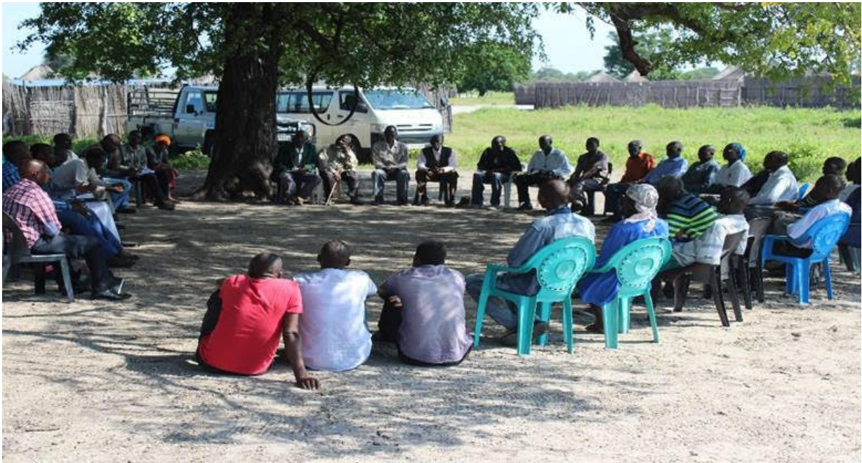
Community meeting at Muketela District Khuta

KAZA's long-term viability depends on strong collaboration between the five governments. It also requires communities to buy into the vision of an immense landscape where natural resources fuel the economy.