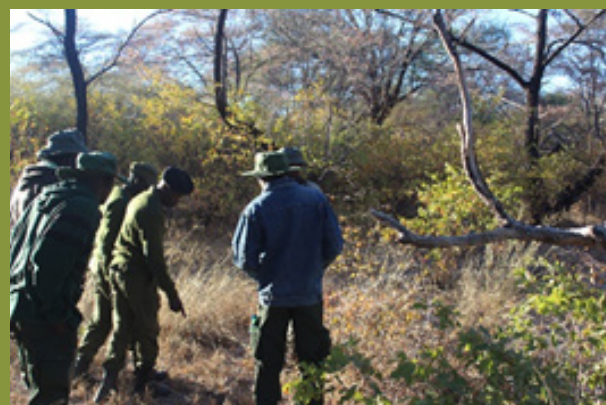
Community game guards from Namibia, Zambia and Zimbabwe doing a joint patrol during the look and learn tour in Lake Liambezi-Namibia.